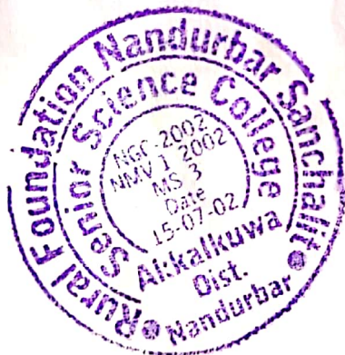
Principal Rural Foundation Nandurbar Sanchalit Senior Science College Akkalkuwa, Dist. Nandurbar